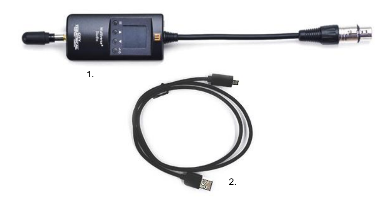
Figure 1: What's Included