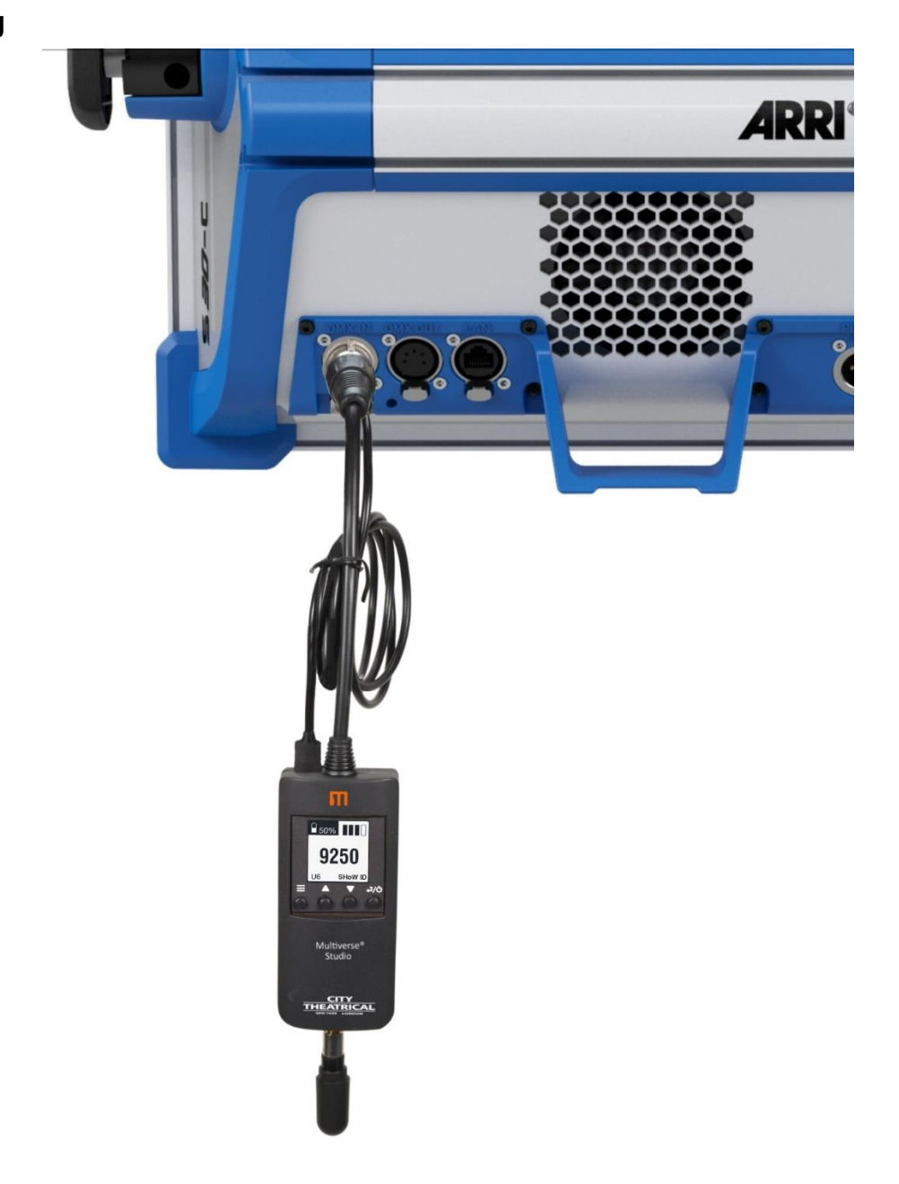
Figure 3: Connected to and Being Powered by USC Cable to Lighting Fixture