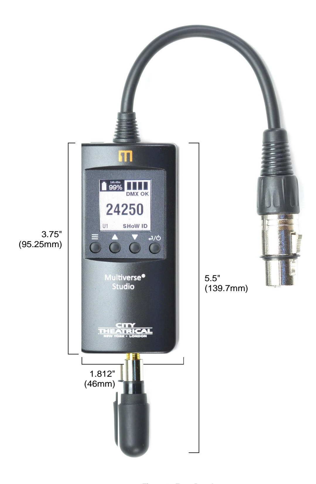
Figure 2: Face Panel